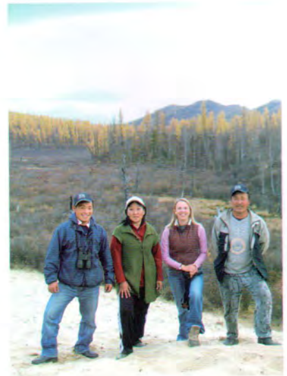
Our field team explores different areas of Mongolia to search for remaining populations of Great Bustard.

For additional information, please see our project website at http://eurasianbustardalliance.org/zh/home-cn/ , where you can access our research papers. We would be glad to hear about your observations of Great Bustards, and news about threats to these birds and their conservation.